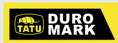
THE LIFE OF YOUR DISK HARROW